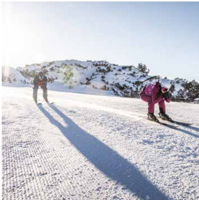
© Dachstein Tourismus AG / Mirja Geh