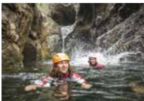
May to October: Tours available upon request

Accompanied by state-certified canyoning guides, visitors climb and swim their way through one of the most beloved and exciting gorges in the region, which is both suitable for beginners and offers challenges for those more experienced. During the trip, you are able to conquer natural terrains by sliding or jumping at various levels of difficulties. (Everyone can, but no one must.)