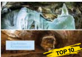
Ice Cave and Mammoth Cave Ticket, Section I: 11 May to 3 November

The spectacular new staging of the Dachstein Giant Ice Cave with suspension bridge and light & sound show offers a breathtaking adventure in rock and ice. Slowly your eyes become accustomed to the shadows of the rocks, crevices and fissures. The Mammoth Cave gets its name from the enormous dimensions of the chambers and passages. With 70 kilometres explored so far, almost one kilometre can be hiked during the tour. The guided cave tours of the Dachstein Giant Ice Cave and the Dachstein Mammoth Cave transport you to the fantastic underground world of the Dachstein with amazing new highlights. Are you ready for an adventure?