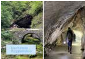
1 May to 29 September Tours available from 9:00 to 16:00 (at least every hour)

A visit to the Koppenbrüller Cave provides insight into the underground water flow inside the Dachstein Mountains. Flood-proof paths allow for visits even in bad weather. From the Koppenrast restaurant, a 15-minute walk along a trail leads to the cave entrance. The entrance is a karst spring which after heavy rain or times of thaw, swells up with masses of water. The brooks inside the cave hold water all the time.